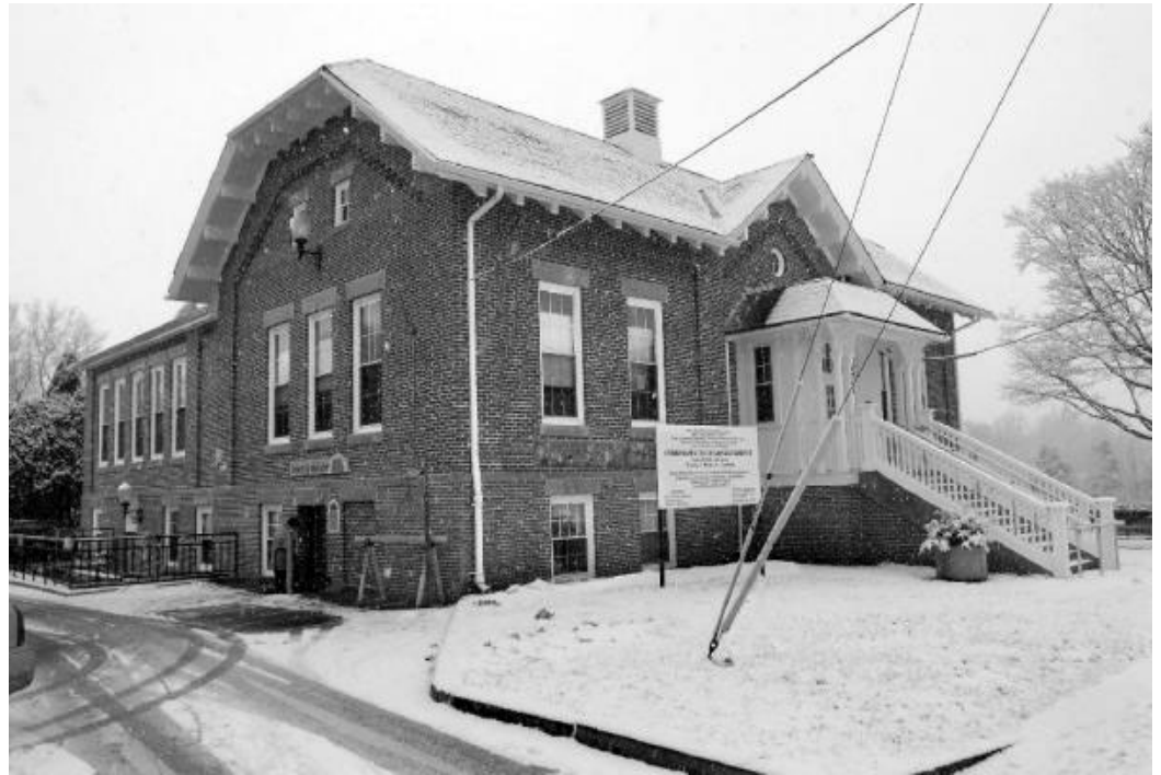
The Survival Center, located on North Pleasant Street.

The Amherst Survival Center incorporates food distribution, daily hot lunches, a food pantry, a free health clinic, a free store,